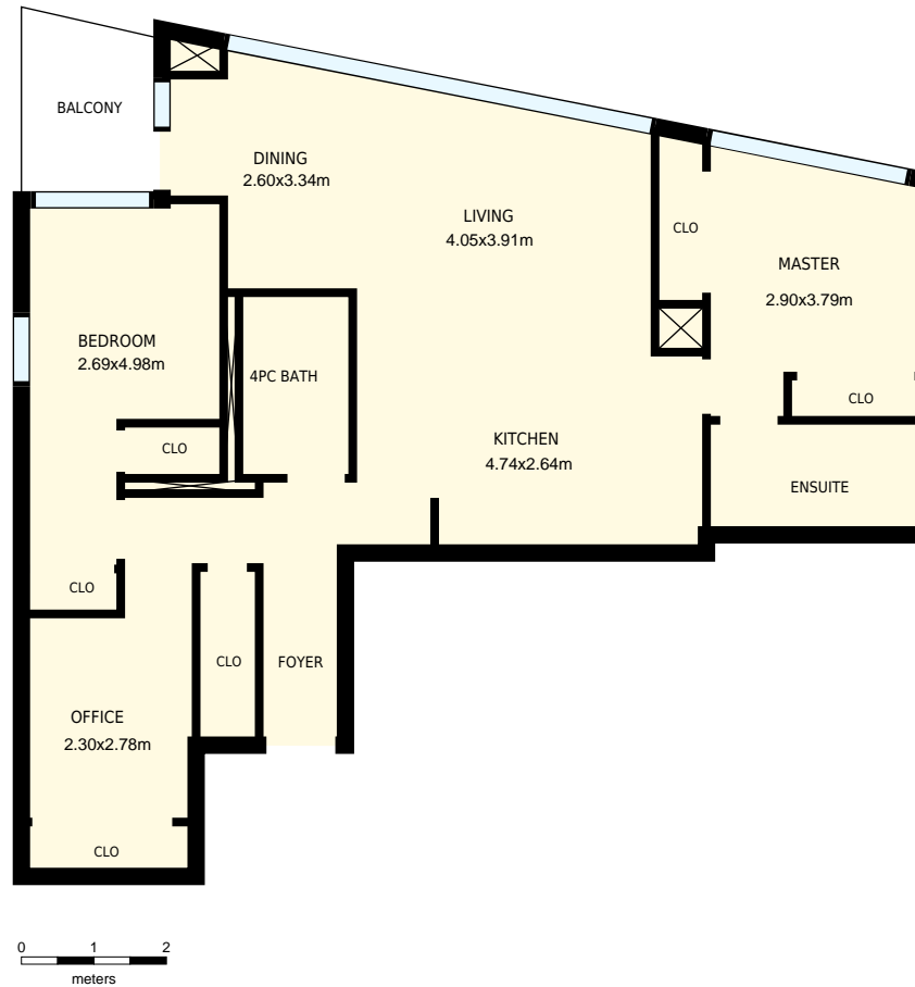
Main Floor Exterior Area 97 m 2

White regions are excluded from total floor area. All room dimensions and floor areas must be considered approximate and are subject to independent verification. For method of measurement please see https://youriguide.com/measure/ .